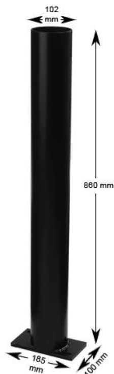
Figure 1 Art.no: 1090178