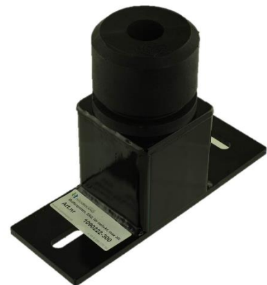
Figure 2 Art.no:1090222 -300mm Variant EN2